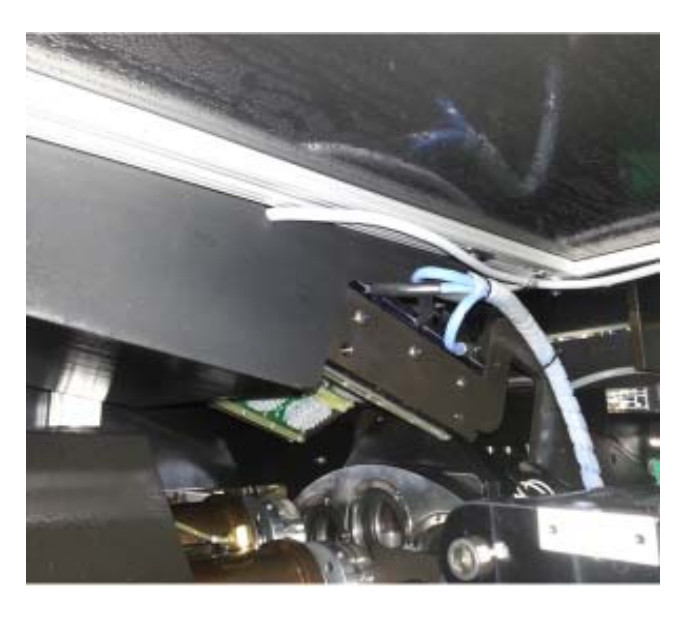
Upper light - open position contacting duct mounting arm

Beginning with orders shipped in April of 2013, this air duct will be replaced by an improved version which eliminates the possiblity of cables being damaged as described.